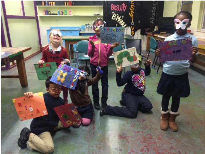
Students enjoyed reading and art in the pilot program with BGCMB. The program continues for a second year beginning in a few weeks!

We're preparing to welcome our TWIGS students back to school the week of October 19 th -- All 700+ of them! The 2nd-8th graders will be attending free after school and Saturday classes in dance, acting, stage production and design, visual arts and music. Our partnership with the Boys and Girls Club of Metropolitan Baltimore will see a second year as we work with kids in centers in the Brooklyn/Cherry Hill and Park Heights neighborhoods.