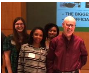
Thomas Dolby & students

School has been in session for only about a month, but students have had quite a few wonderful opportunities to work with and learn from master artists already!